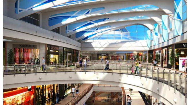
Luxury Balkan Mall, Skopje, Alexander the Great Airport

As far as the new space is concerned, Skopje retail market will be enriched by two shopping malls, which are currently under construction. The first complex comes as a public-private partnership of a local company and the Municipality of Gjorche Petrov. This complex will accommodate the shopping area of 30,000 sq m of GBA, located on the main city boulevard. The second complex is developed as mixed-use scheme that includes four forty-storey high residential blocks and a shopping mall of 32,000 sq m, spread on the ground and three upper levels. These modern mixed-use retail schemes are expected to be completed over the course of the next two years. Furthermore, one of the largest announced projects is the Luxury Balkan Mall, to be developed in the vicinity of Alexander the Great Airport. The Bulgarian investor ISA 2000 plans to build a mall double in size of what is currently the biggest shopping mall in Skopje, Skopje City Mall, which comprises 100,000 sq m of GBA/39,000 sq m of GLA.